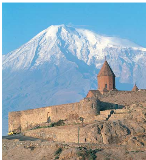
Khor Virap monastery

Visit to Khor Virap monastery located in the Ararat plain in Armenia, near the closed border with Turkey. The Ararat Mountain is making an amazing landscape. The taller peak reaches 5.165m, whereas the small one is just 3.900m high; they are separated from each other by the 11.3km distance. The Khor Virap Monastery is a shrine and a pilgrimage site important to the Armenian Christianity. The church complex is built atop the pit (= virap in Armenian), where St. Gregory the Illuminator was cruelly imprisoned, some time at AD 288 by the heathen Armenian King Trdat III. St. Gregory suffered his imprisonment in that pit for 14 years until upon miraculously curing the king of a loathsome disease, the king freed him and converted himself and Armenia to Christianity. In 301, Armenia was the first country in the world to be declared a Christian nation.