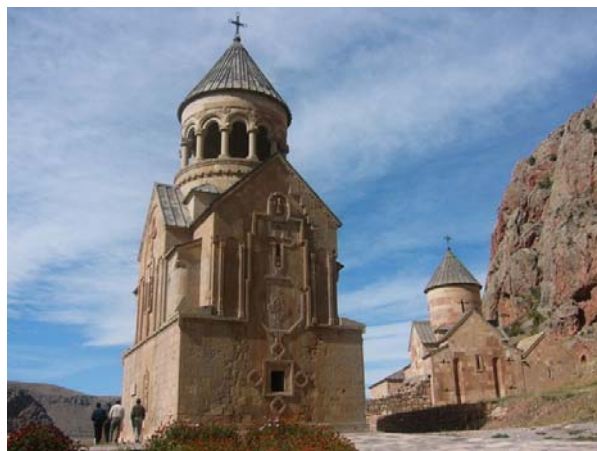
Noravank monastery (13th-century)

Noravank means “new monastery” in English. The church, completed in 1339, is said to be the masterpiece of the great medieval Armenian architect, Momik. Two extremely narrow steps form a cantilever lead up to the main hall of the church. The fine carved relief of Christ over the doorway, flanked by St. Peter and St. Paul. Above the ground-floor directly below the cantilevered stairs, there is a carved relief of the Holy Virgin with Jesus set on her lap and a pair of angels.